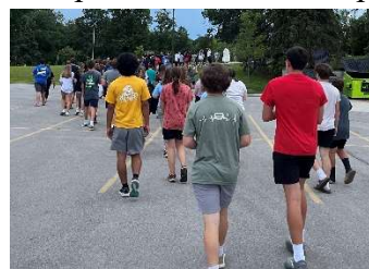
Procession to Adoration

A special thanks to our participants and chaperones!